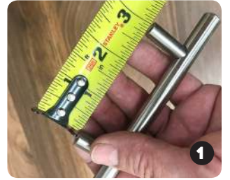
Measure your hardware