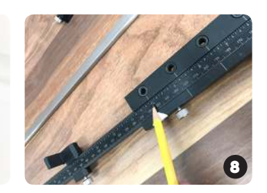
Set end stop at desired distance from center line of bushing