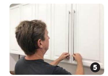
Position hardware by hand to find where you like it and mark position of bottom hole