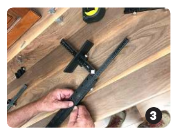
Slide the shelf pin extension onto Tighten thumb screws the tp-1934