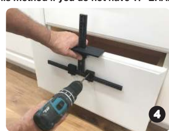
Center on drawer and drill holes