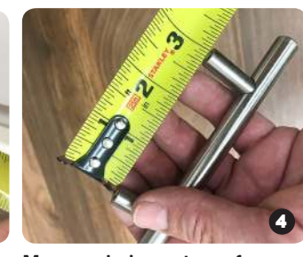
Measure hole centers of your