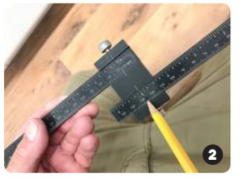
Align each ruler at the 5" mark to extend the length of ruler to 17"