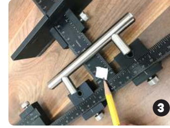
slide two drill bushings onto the tp- tighten sliding bushings into position 1934 Using the same measurements cover the center bushing with tape