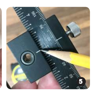
Transfer your hardware measurement to the sliding drill bushing and tighten