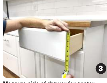
Measure side of drawer for center.