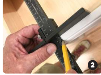
Mark center top of drawer