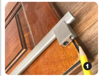
We demonstrate a method to line up center of one hole with