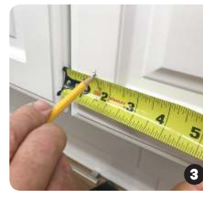
Measure from side