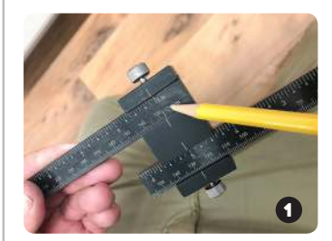
For fast repeatability use the Extended Ruler Attachment