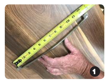
Measure hardware hole spacing