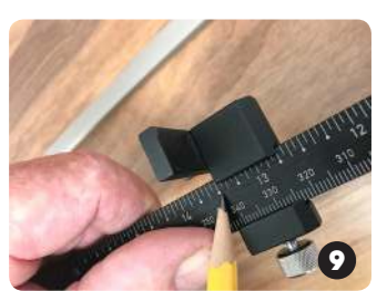
Set the sliding end stop 31/2 out on the era from bottom hole