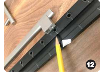
Mark hole location with tape