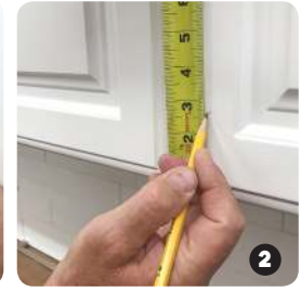
Measure from bottom mark position with pencil