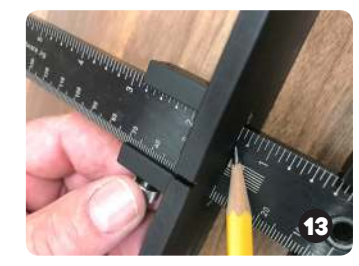
Adjust Large Stop to 1 3/8" to match the measurement from side edge