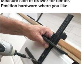
Drill hole using fixed center drill bushing