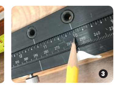
Mark selected drill bushing with tape on extension (included in TP-2312, TP-1935)