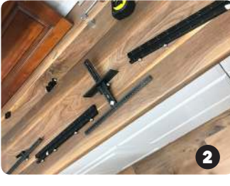
Use TP-1934 with long hardware/ shelf pin extension and the TP-ERA