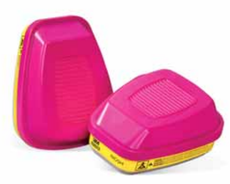
3M™ Multi Gas/Vapor Cartridge/Filter 60923