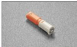
DPASN - beige