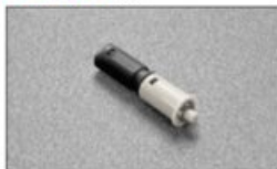
DPMSNB - beige